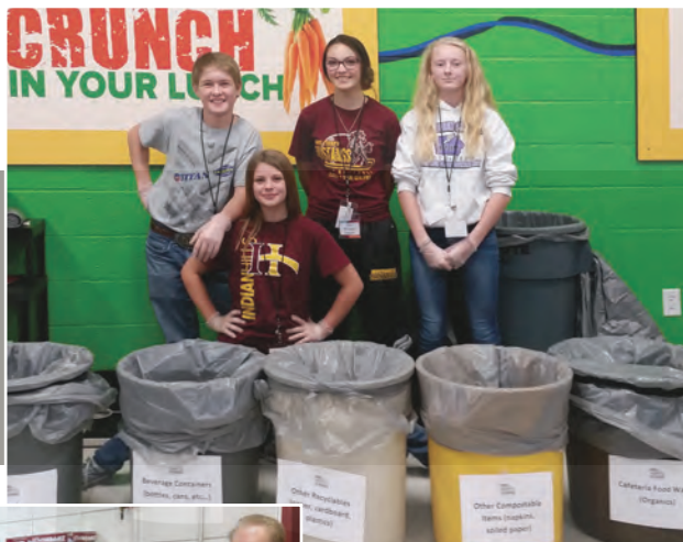
» Middle School students volunteered to help their peers sort waste from trays after lunch.