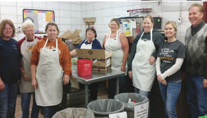
« Davis County CSD kitchen staff take a break to pose for a photo during the waste audit.

This material is based upon work supported under a grant by the Rural Utilities Service, United States Department of Agriculture. Any opinions, findings, and conclusions or recommendations expressed in the material are solely the responsibility of the authors and do not necessarily represent the official views of the Rural Utilities Service.