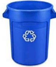
Recycling x2 32 gal