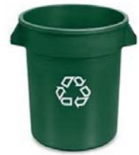
Compost x4 32 gallon