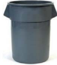
Landfill/Trash 32 gal