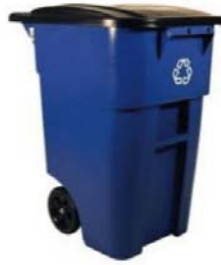
Recycling 50 gal